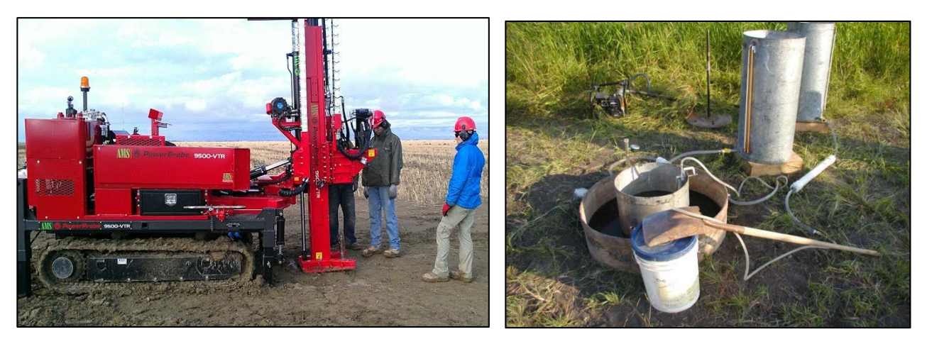
Track-mounted drill rig creating a bore hole for soil sampling and hydraulic conductivity testing (left), and ring permeameter test (right).

Staff gages are planned for installation at various locations in the Eastside Bypass between Washington Road and Reach 5. The staff gages will be fitted with piezometers and constructed from 2-inch diameter PVC pipe, steel drive-points, and PVC caps. Each will be manually installed in the stream bed with a hand-held slide hammer to three to seven feet. Each piezometer will be screened at various depths to monitor subsurface and water column conditions. Following installation, some piezometer staff gages may be fitted with water temperature sensors.