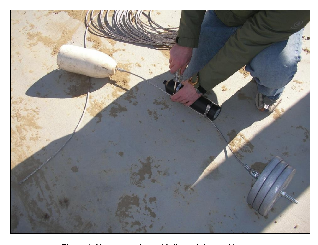
Figure 6: Vemco receiver with flat weights and buoy