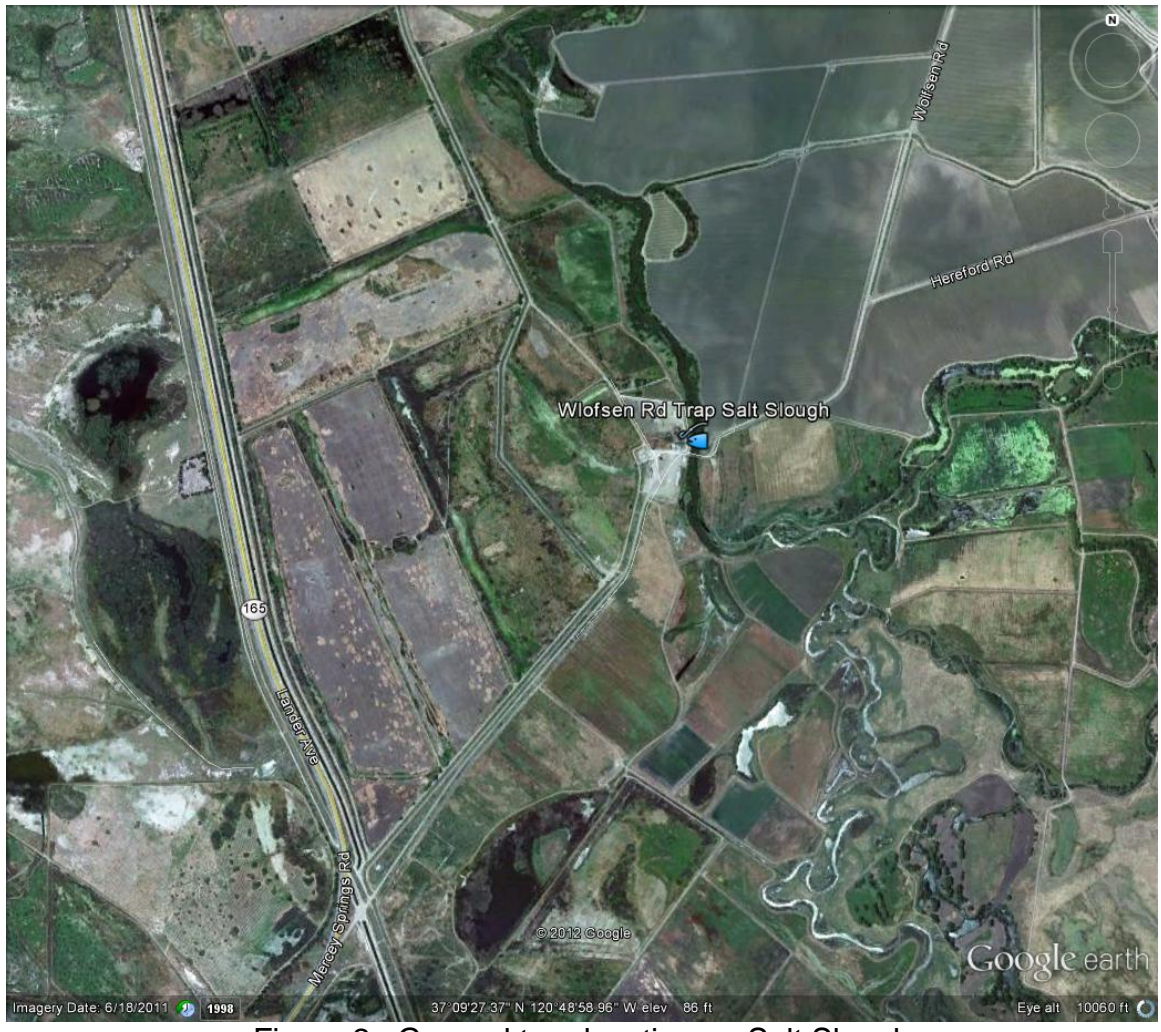
Figure 2: General trap location on Salt Slough