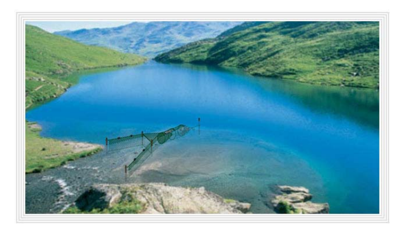
Figure 5: Image of Fyke net