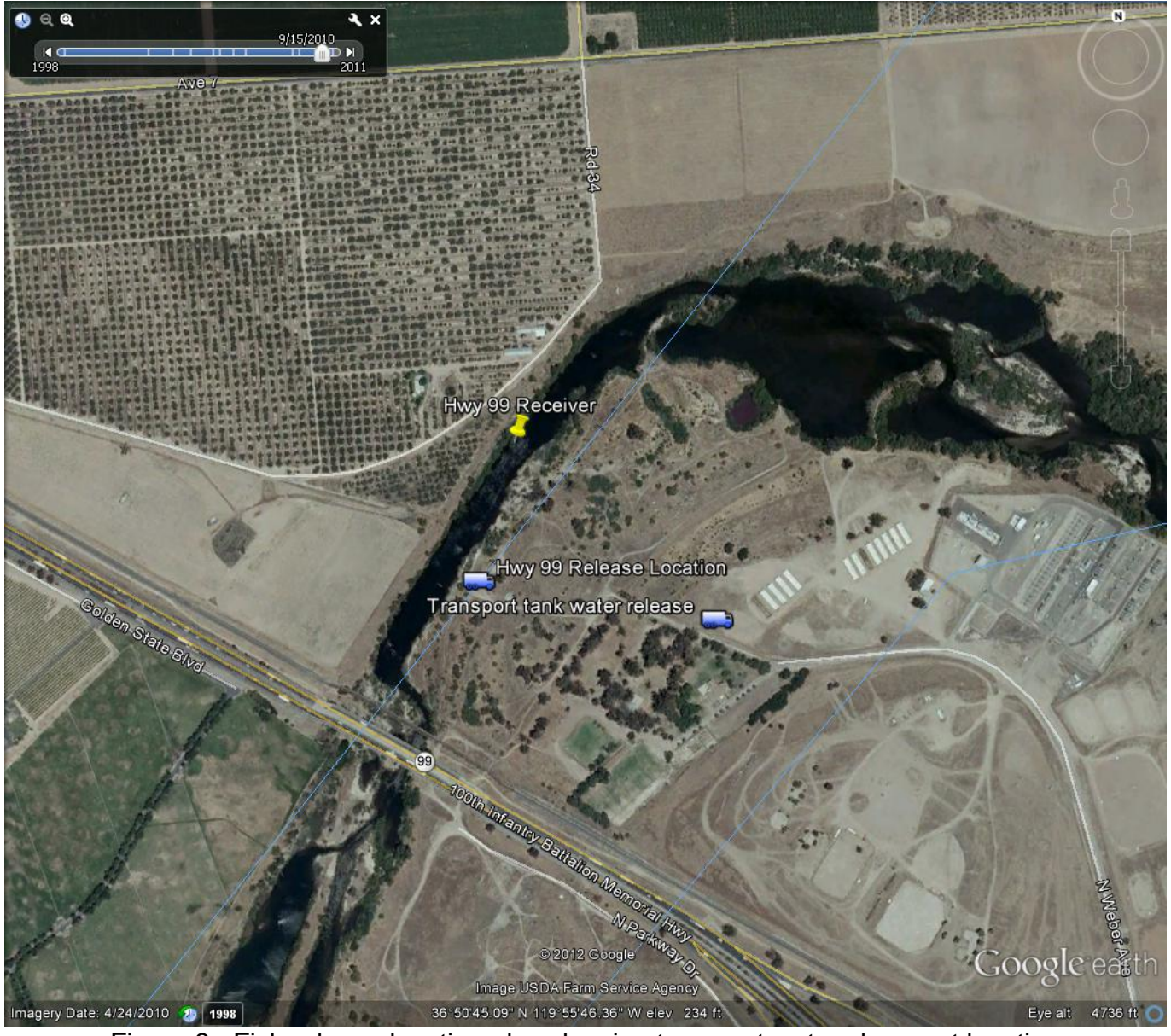
Figure 3: Fish release location also showing transport water clean-out location