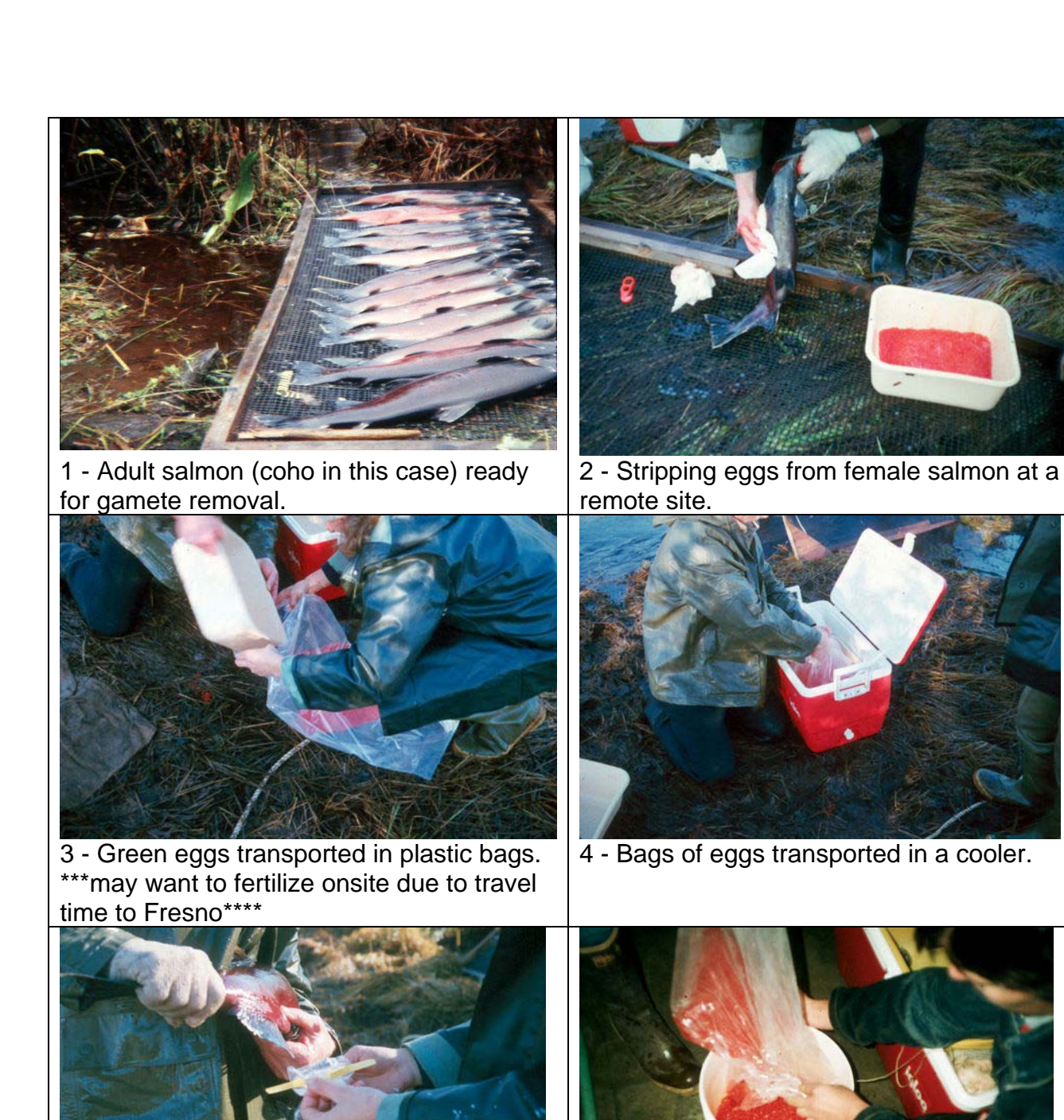
5 - Milt placed into plastic bags for transport. 6 - Eggs emptied into plastic buckets for fertilization at the incubation location Figure 7. Photos of similar streamside spawning activity