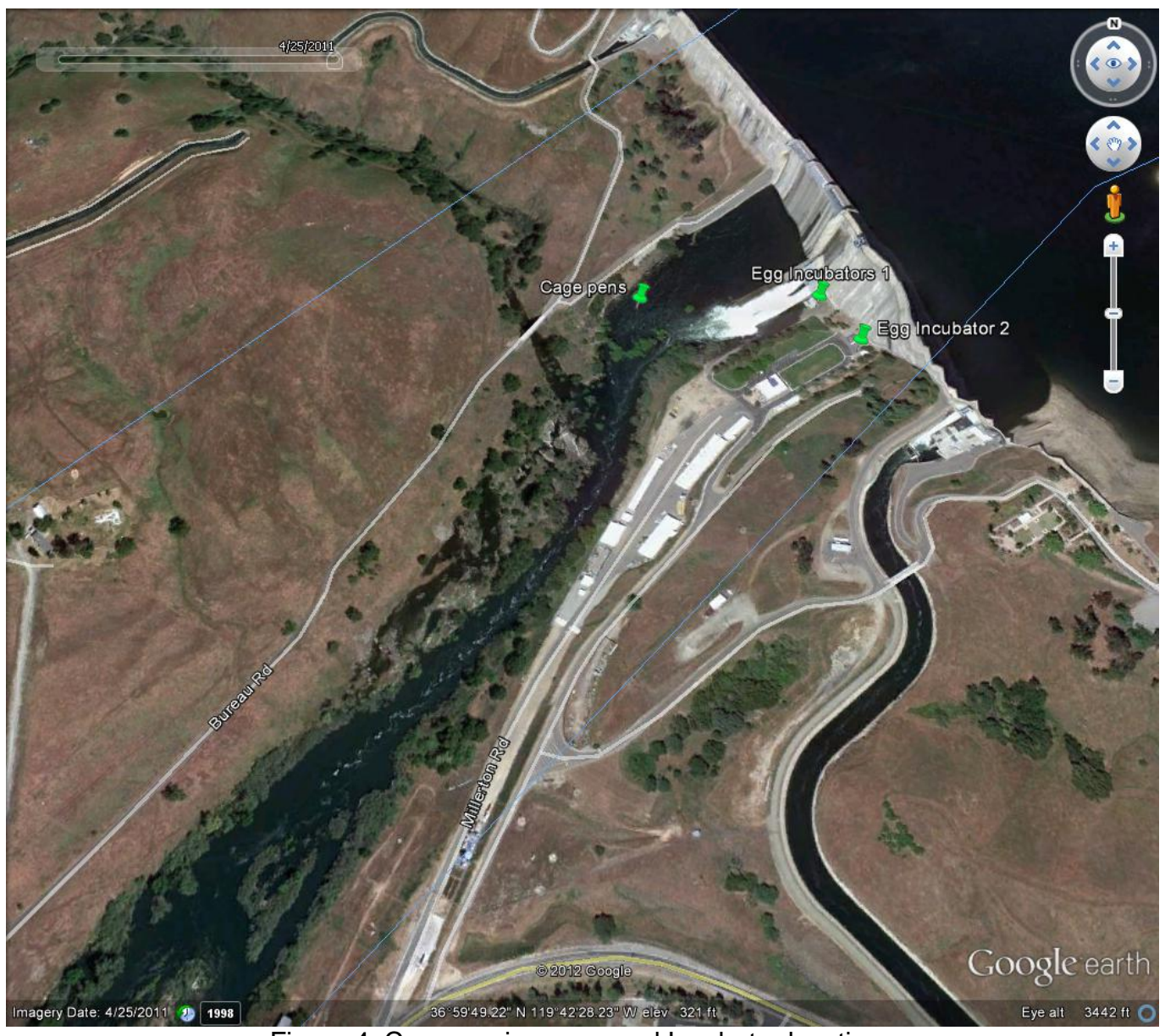
Figure 4. Cage rearing pens and Incubator locations

Describe the environmental setting for the study. The Program will move fish above fish passage barriers to suitable spawning habitat. Reaches 2, 3, and 4 of the Restoration Area do not contain suitable spawning habitat. Therefore, only Reaches 1 and 5 of the Restoration Area are described below