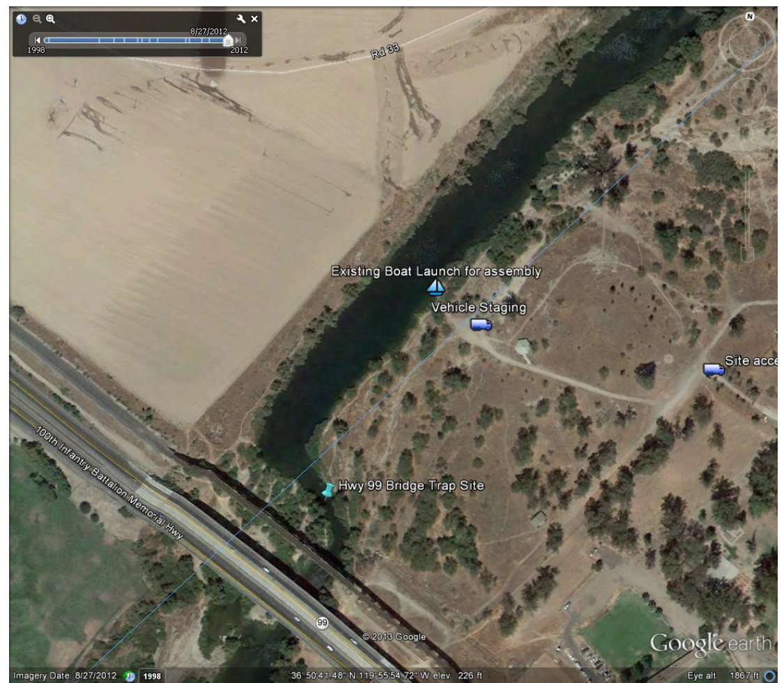
Figure 1. General Location for RST Deployment at SR 99

If juvenile Chinook Salmon trap and haul is conducted, juveniles trapped in the downstream most RST will be held in live wells at the RST, for up to a week, until a sufficient number of juveniles has been trapped for transport and release at or downstream of Reach 5.