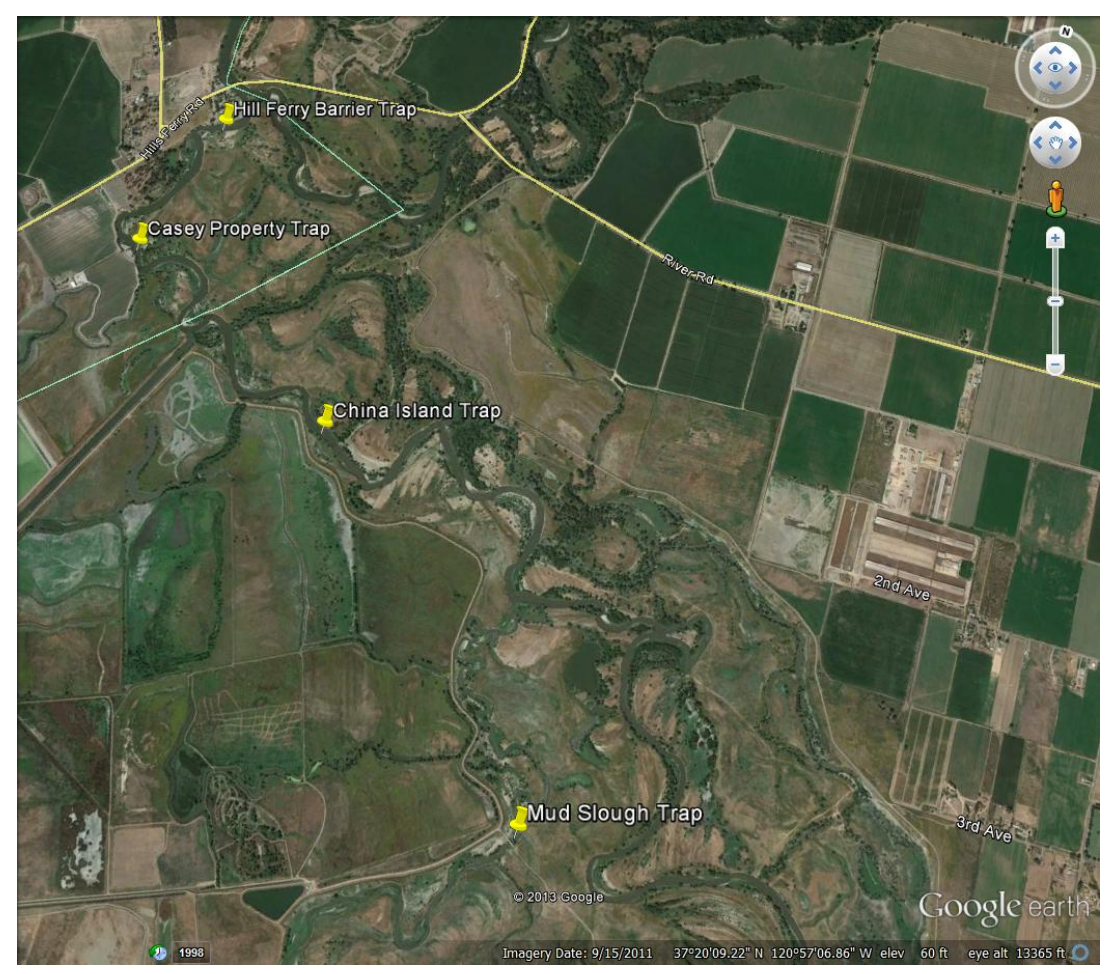
Figure 1: General location for traps above Hills Ferry Barrier on the San Joaquin River and one location on Mud Slough

Moving or expanding trap locations in the future may include placing a trap on Sack Dam or placing a net trap just downstream of Sack Dam.