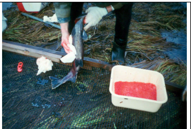
2 - Stripping eggs from female salmon at a remote site.