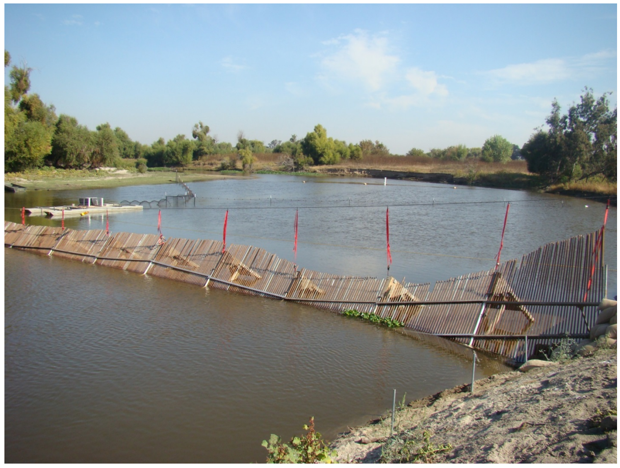
Figure 6: fyke trap with floating trap downstream of Hills Ferry Barrier