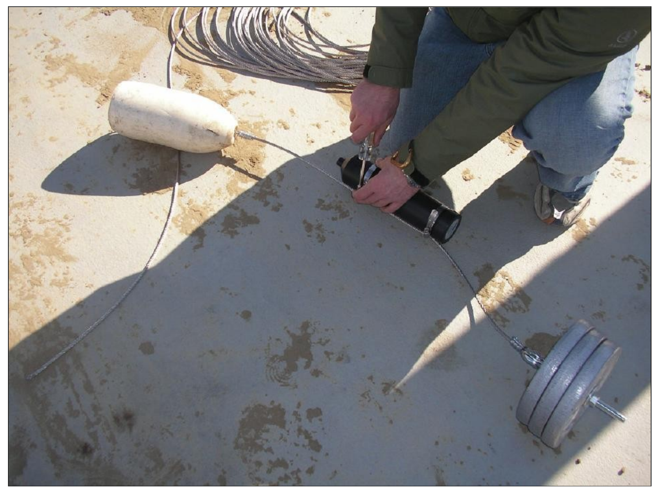
Figure 8: Vemco receiver with flat weights and buoy