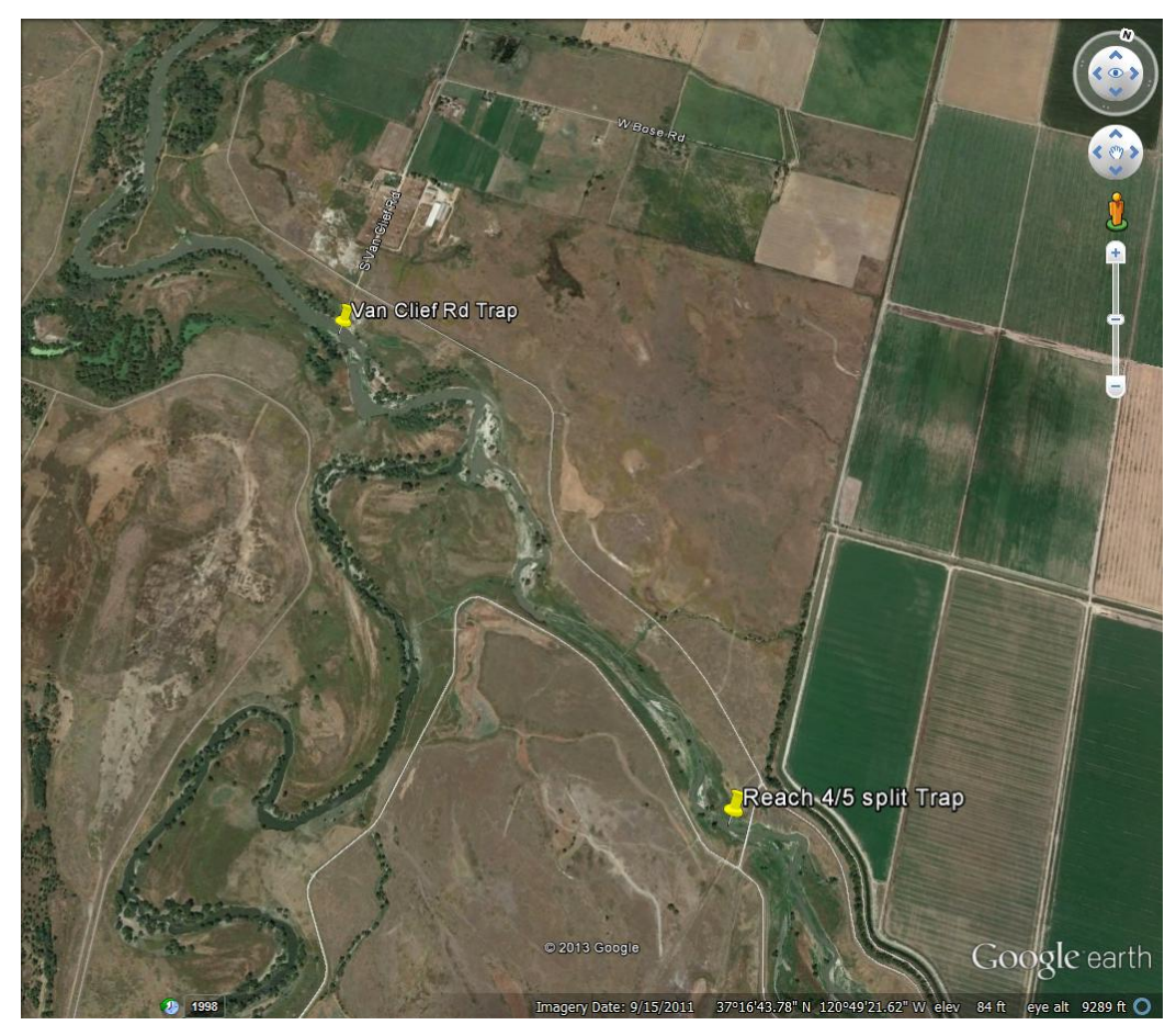
Figure 3: Upstream San Joaquin River traps