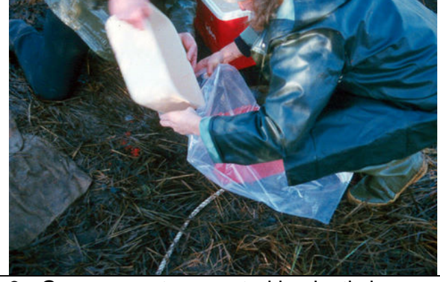
3 - Green eggs transported in plastic bags. ***may want to fertilize onsite due to travel time to Fresno****