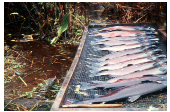
1 - Adult salmon (coho in this case) ready for gamete removal.