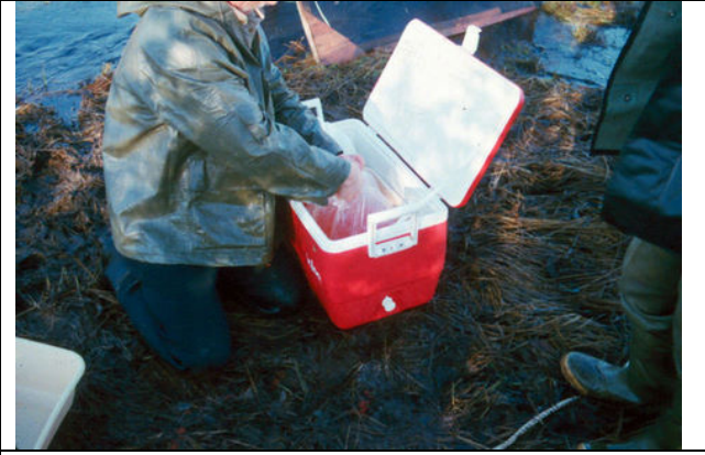
4 - Bags of eggs transported in a cooler.