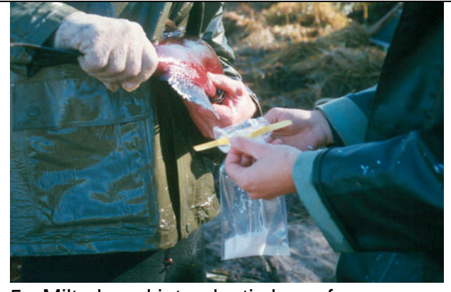
5 - Milt placed into plastic bags for transport.