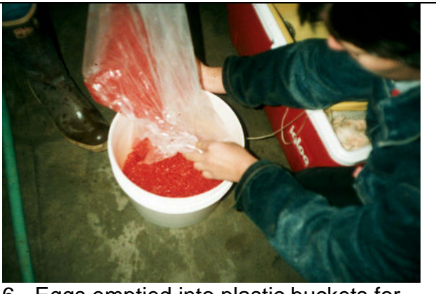
6 - Eggs emptied into plastic buckets for fertilization at the incubation location