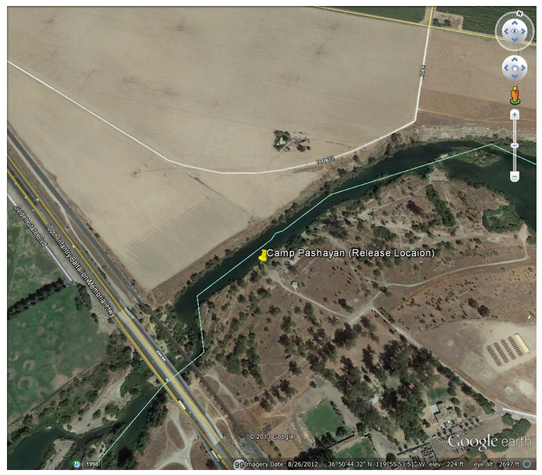
Figure 4: Fish release location also showing transport water clean-out location