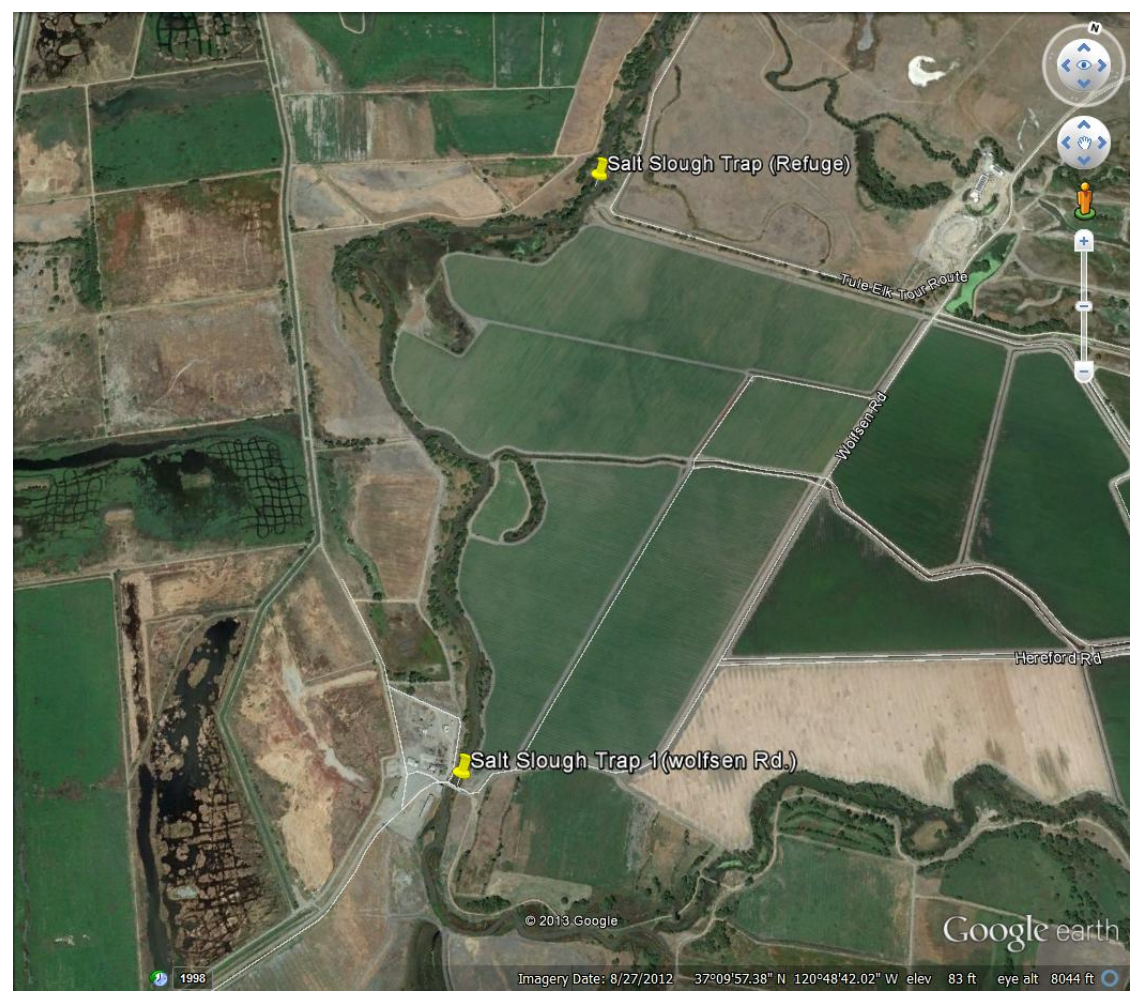
Figure 2: General trap locations on Salt Slough