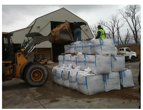
Figure 1. Fully Filled Super Sacks

Trust (MLT) Berm Repair will construct an access road and super-sack cofferdam to minimize seepage and allow for dewatering of the MLT property (Figure 1). Additional construction activities may include building a working pad to allow heavy equipment to gain access to seepage areas and localized trenching and culvert installation to aid in field drainage. Reclamation acquired the MLT property in 2018 as part of the Reach 2B and Mendota Pool Bypass Project. See Figure 2 and Figure 3 for additional project details.