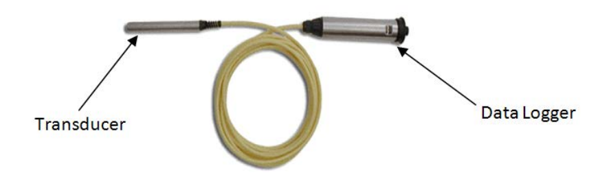
Figure 1. Water Level Recorder

Stage data are collected by the recorders (Figure 1) at 15 minute intervals. These data are periodically downloaded and converted to water surface elevations. The necessary calculation methods were described in the 2010 ATR in detail.