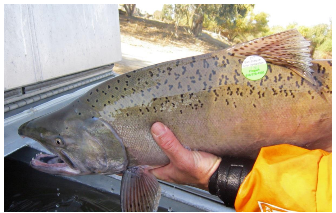
Figure 5. Fall-run Chinook Salmon Captured in the San Joaquin River Displaying Peterson Disc Tag and Being Placed into Oxygenated Transport Tank