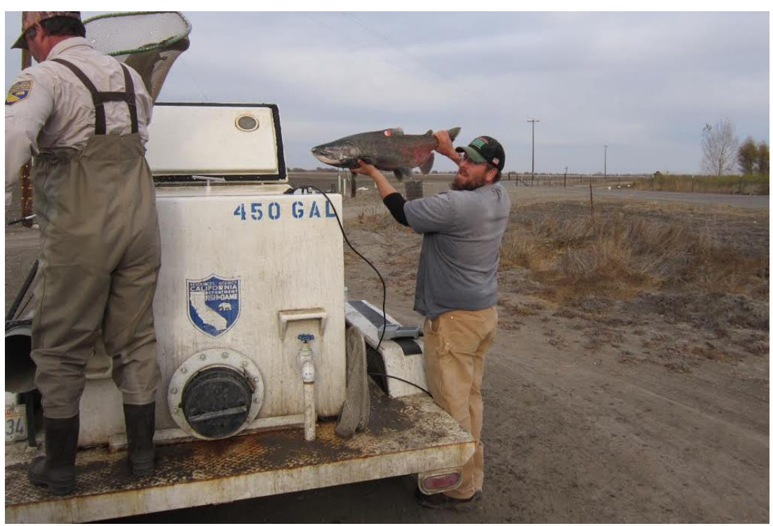
Figure 7. California Department of Fish and Wildlife and Reclamation Personnel Transferring an Adult Fall-run Chinook Salmon into the CDFW Fish Transport Tank

Following capture, fall-run Chinook salmon will be placed in an oxygenated tank (CDFW Tank = 1500 - 1700 L, Reclamation Tank = 2100 - 2300 L), with a maximum of 20 (CDFW transport tank) and 25 (Reclamation transport tank) adult salmon per tank (Figure 7). Transport water will be collected directly from the SJR near the collection sites to ensure minimal differences in water temperature. Salt will be added at approximately 6 - 10 ppt to alleviate osmotic imbalance and stress-related effects. Oxygen will be supplied via a compressed-gas cylinder and oxygen regulator in an effort to maintain dissolved oxygen levels \geq 8 mg/L. Environmental conditions (water temperature (°C), conductivity (mS/cm), salinity (ppt), and dissolved oxygen (mg/L)) will be collected with a handheld multiparameter instrument before loading fish and immediately prior to fish release.