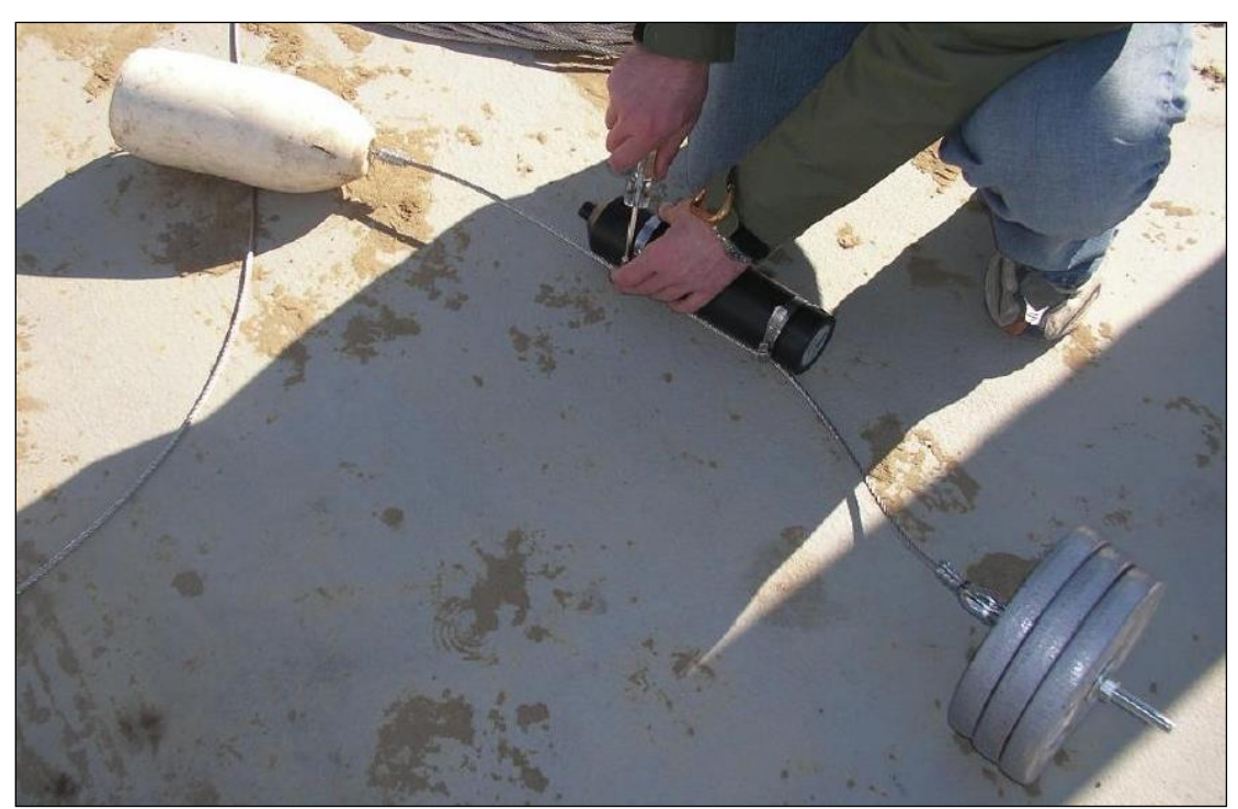
Figure 8. A single Channel Acoustic Monitoring Receiver (Vemco) Being Attached to a Stainless Steel Cable with Weights and Bouy. Stationary Receivers will be used to Track Movements of Adult fall-run Chinook Salmon in Reach 1 of the San Joaquin River

Passive tracking - Single channel acoustic monitoring receivers (receivers; Vemco, Bedford, Nova Scotia), capable of identifying coded transmitters implanted in fall-run Chinook salmon, will be strategically placed, from Friant Dam downstream to State Route 99, to monitor fish movements throughout Reach 1. Up to 20 receivers may be deployed to promote tracking. The receivers will be moored using stainless steel cable anchored to the bank and weighted to the bottom using flat weights, or cement blocks (Figure 8). Nearby structures or trees along the bank will be used to anchor receivers. If these are not available, T-posts will be used to anchor receivers. To keep receivers vertical in the water column, a boat buoy will be attached to the receiver as well. Receivers will be installed in September and will be retrieved in January if conditions allow.