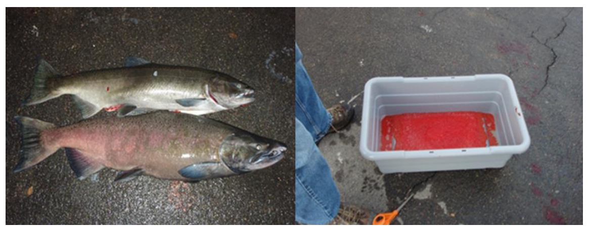
Figure 9. Post-spawned Female (top left image) and Male (bottom left image) Fall-run Chinook Salmon, and Resulting eggs (right image), from 2013 Streamside Spawning Activities

Stream-side incubators - Eggs used in stream-side incubators will be placed in lockable incubators or vertical incubation trays that will either be housed on BOR property near Friant Dam or in a locked trailer. Water for the incubators will be obtained from the SJR through existing plumbing from the BOR facility with water being discharged directly to the river. The eggs themselves do not generate any waste, but may need application of iodine up to three times throughout the incubation phase at a rate of 100 ppm. Treated water will not be drained back to the SJR. After eggs hatch and are in the swim-up stage they will be moved to in-stream holding pens to rear to an appropriate size.