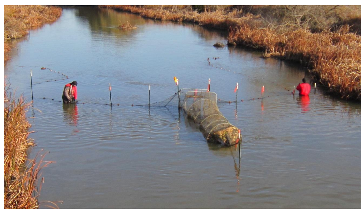
Figure 3. Reclamation Personnel Attaching Wing Walls of fyke net to t-posts. Central Net Opening Faced Downstream to Catch Upstream Migrating Fall-run Salmon to Promote Transport of these Fish to Reach 1 of the San Joaquin River Restoration Area