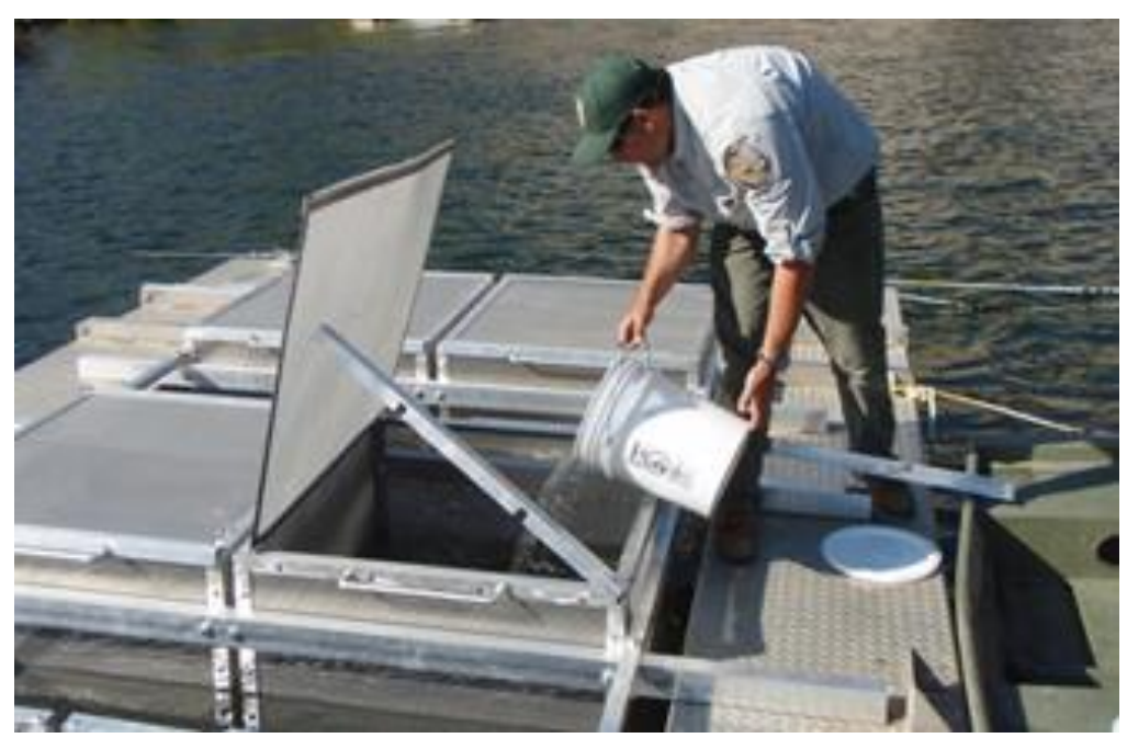
Figure 10. California Department of Fish and Wildlife Personnel Transferring Fish into Holding Pens Where juvenile Fall-run Chinook Salmon were Maintained Before Release in the San Joaquin River