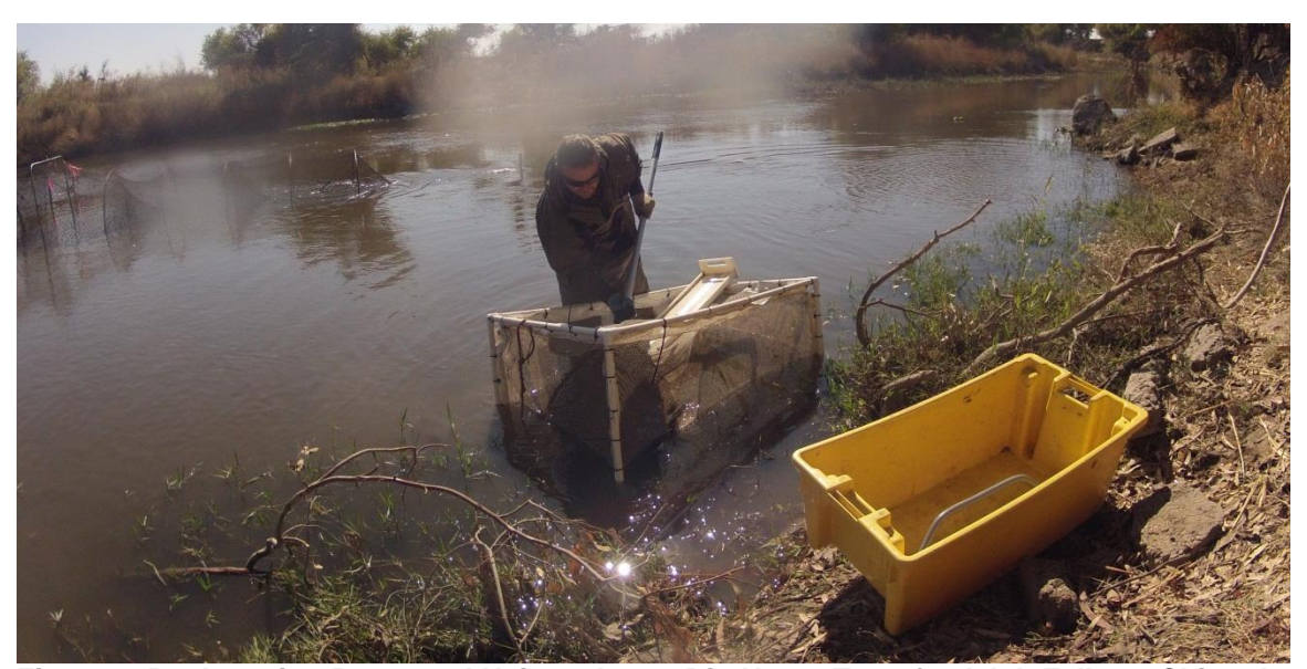
Figure 4. Reclamation Personnel Using a Large Dip Net to Transfer Adult Fall-run Chinook Salmon from a Live-cage to a Portable Plastic Trough for Processing

All captured fish will be removed from nets, weirs or canals, and temporarily maintained in net pens (61×81×135 cm, 0.64 cm mesh) until they can be processed (Figure 4). Bycatch (all non-salmonids) will be measured (nearest mm, fork and total length) and released upstream of the nets and weirs to minimize likelihood of immediate recapture. Chinook salmon will be transferred; one at a time using plastic coated dip nets, from the net pen to a portable plastic trough (66×43×25 cm) filled at least ½ full with SJR water. This method will permit minimal atmospheric exposure during transfer and processing. A fin-clip will be collected from the dorsal or caudal fin, for DNA analysis from each salmon captured. Fish will be sexed (males checked for presence of milt/females determined to be gravid), tagged (see "Tagging methods"), measured, checked for the presence of an adipose fin, overall condition will be recorded, and all captured salmon will be photographed.