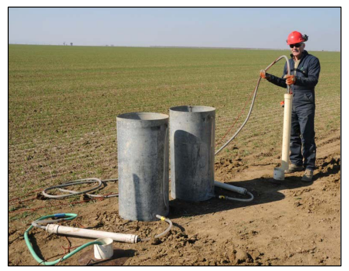
Figure 2: Shallow well pump-in test (left), and ring permeameter test (right)

The hydraulic conductivity testing will be performed by a crew of up to five people. Field engineers will access the site by vehicle, drill rig, or on foot. Tests may occupy up to eight square feet. All bore holes will be backfilled.