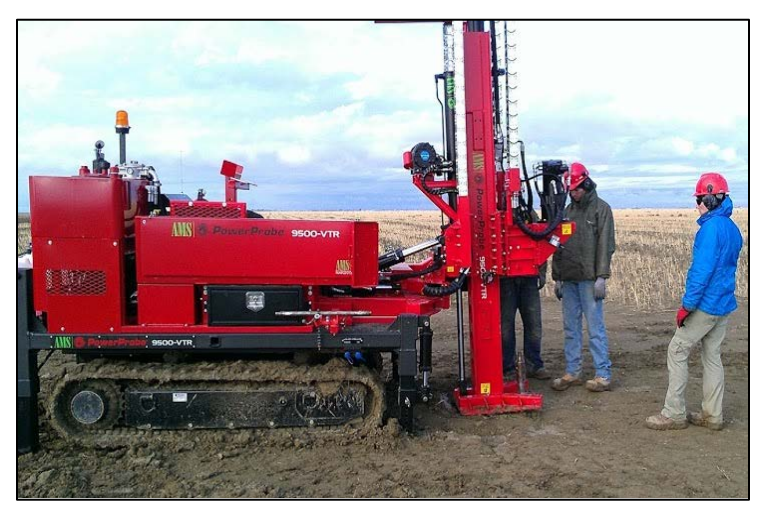
Figure 1: Drill rig creating a bore hole for shallow well testing.

Two hydraulic conductivity tests are performed at each site to measure the vertical and horizontal movement of water through the soil. Horizontal tests will be conducted by temporarily installing a shallow well. Depending on the height of groundwater, water is either pumped in or bailed out of the shallow well over a 24-hour period. Vertical tests will be conducted by a double ring permeameter, or infiltration, test. This test features insertion to two steel casings to a depth of three inches. Water is pumped into both rings over a 24-hour period, with the rate of water infiltrating within the central ring providing the test data.