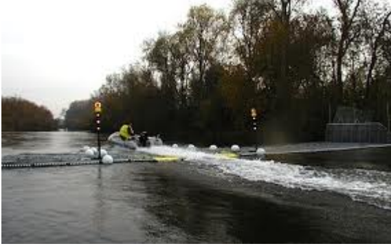
Figure 1. A motorized boat passing over a floating resistance weir.