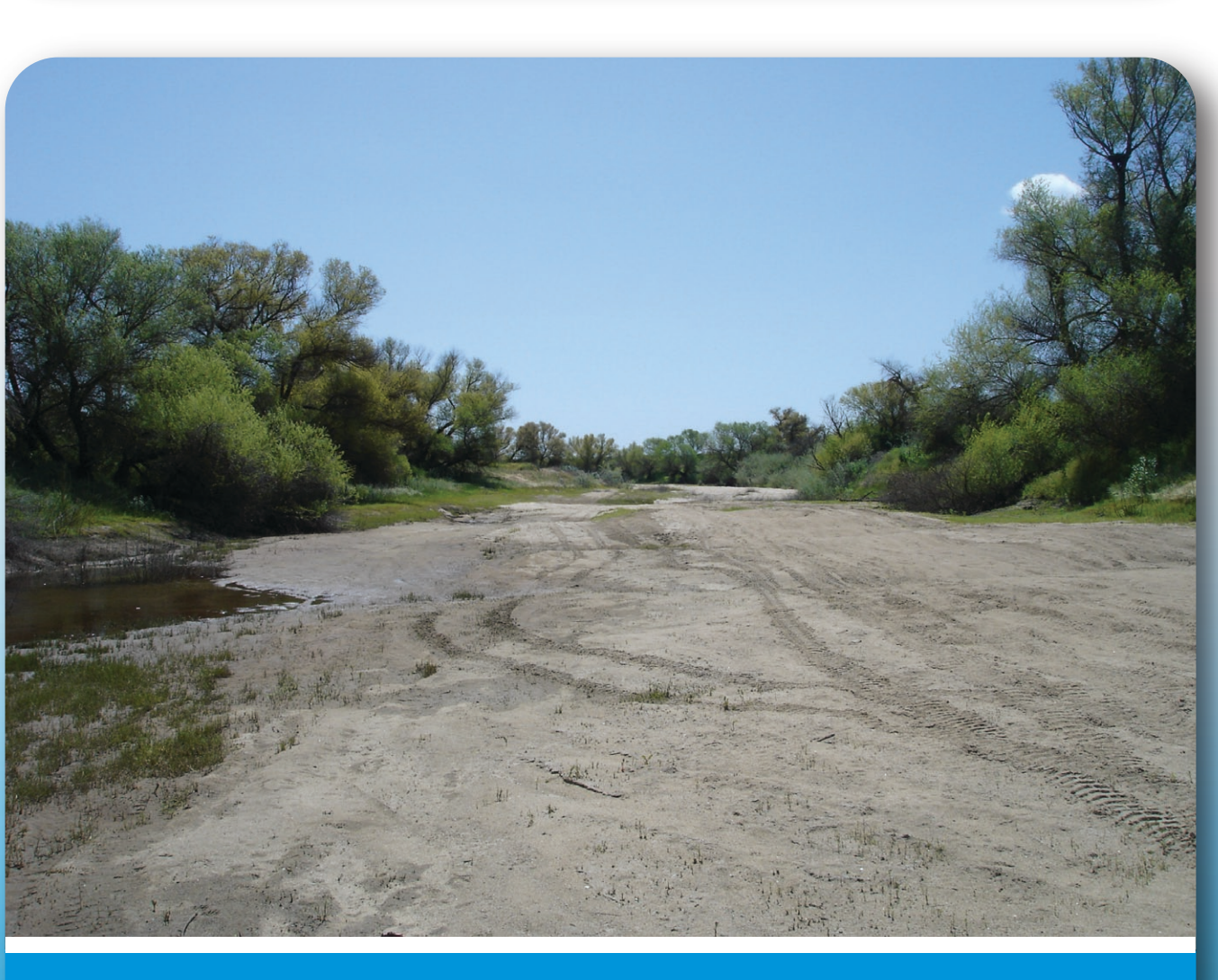
San Joaquin River below Gravelly Ford