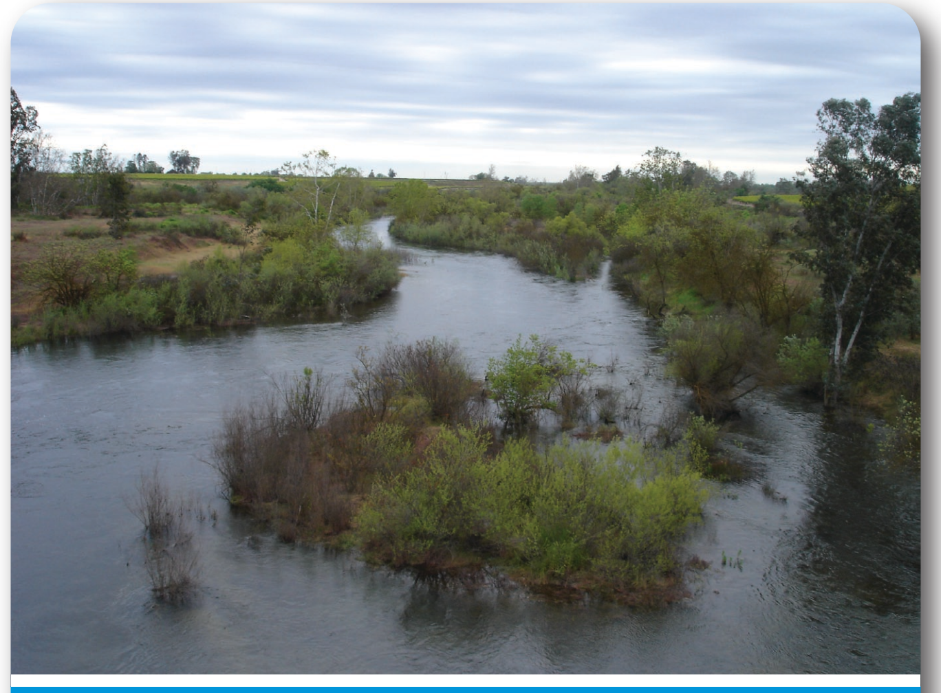
San Joaquin River at State Route 145

Submit report to Congress on the reintroduction of spring- and fall-run Chinook salmon