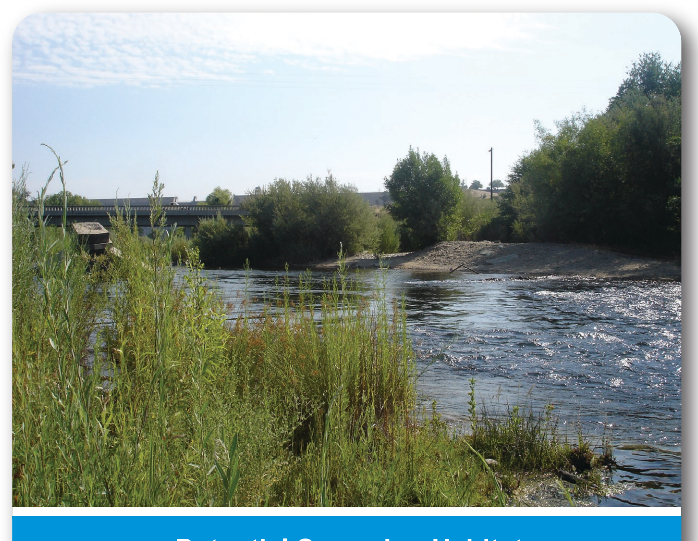
Potential Spawning Habitat